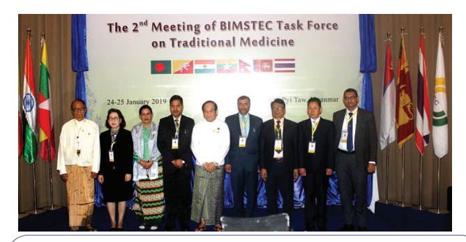
H.E. the Union Minister of Health & Sports of Myanmar (centre) with the heads of delegation from the BIMSTEC Member States during inaugural session of the Meeting on 24 January 2019 in Nay Pyi Taw.

The Second Meeting of the BIMSTEC Task Force on Traditional Medicine (BTFTM) was held on 24 -25 January 2019 in Nay Pyi Taw at the invitation of the Republic of the Union of Myanmar. Delegations from all Member States attended the meeting, including from the Secretariat of BIMSTEC.