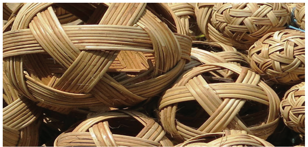
Traditional Cane –Ball used for the game of Chinlone.

Traditionally considered as the men's daily pastime, is a way of life today, particularly among the locals for practical reasons vis-à-vis to take a break for exercise when they are struck with cramps on their back or limbs due to over working, sitting or standing for too long.