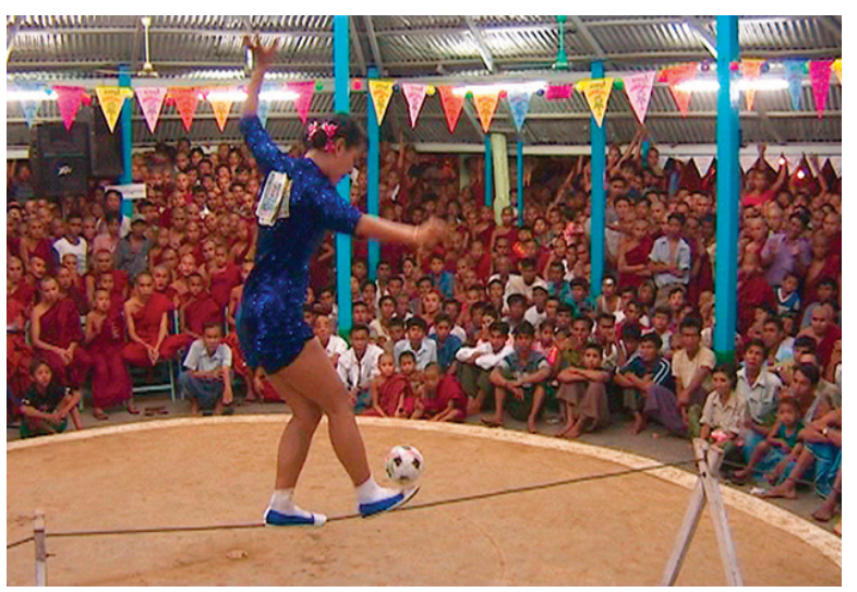
Demonstrating the game of Chinlone with skills of balancing the ball

To the outsiders. Chinlone is seen as a kind of musical game, with rhythm of the music harmonizing the mood and movements of the players. There's a full of joy & fun in the game of Chinlone with no hurry and worry to win or lose. No complicated rules to follow either. In deed, it's an opportunity for both men and women to show-off their beautiful physics, the fashion of tattoos, built-in muscles and the feminine body elasticity through the world of dancing to the rhythms of musical band. It is also a unique musical game to entertain the public during the festivals and special occasions in Myanmar and a better way to promote and preserve Chinlone as the National Game of the people of Myanmar.