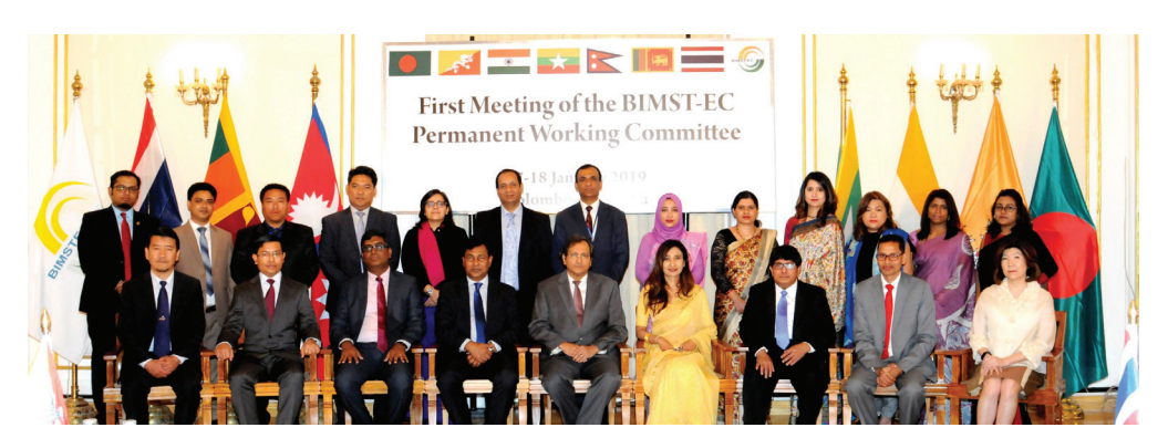
Delegations from the BIMSTEC Member States at the First Meeting of the BIMSTEC Permanent Working Committee (BPWC) in Colombo, Sri Lanka.

The First Meeting of the BIMSTEC Permanent Working Committee (BPWC) was held in Colombo on 17-18 January 2019 with the participation of representatives from all Member States and the Secretary General of BIMSTEC. The Foreign Secretary of Sri Lanka inaugurated the Meeting.