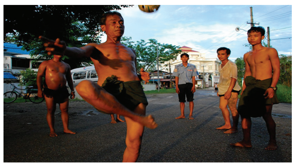
Game of Chinlone in progress

Chinlone co-existed with the people of Myanmar since the time immemorial and as such it has been a part of their daily lives touching deep into their hearts. However, no one is really aware of its emergence, except that it is believed to have been derived from the ancient Chinese game of "tsu chu", which is recognized by FIFA (football's world governing body) as the oldest form of football in recorded history of the world.